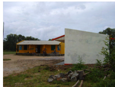
Tampinas second school building: Front view with workers and villagers (top), the interior (middle) and together with the old building (bottom).