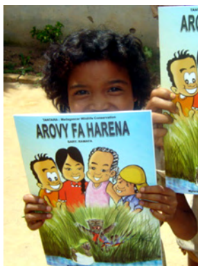
A school girl with her new comic book in Ambodivoara.

Major progress was made in the MWC educational comic project: 500 comic books with the title 'AROVY FA HARENA' - Malagasy for 'Preserve because it is a Richness' - were distributed. The comics were printed at the E.I.I. - 'Entreprise Individuelle d'Imprimerie' in Antananarivo and comprise 30 pages in black&white, while the cover is printed in colour.