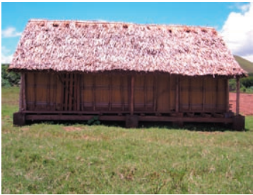
From the beginning of construction in October 2005 to the completed Sihanaka cabin in April 2006

Representatives from Conservation International (CI), ANGAP, Water & Forest Ministry and seven mayors of different Alaotra villages examined the camp and were very impressed. The cooking cabin, the separate toilet cabin and the wooden fence surrounding the whole camp will be constructed during the next months.