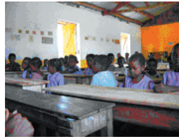
School children of the EPP Tampina sitting on their new benches.

Currently, different offers for the construction of the second school building are under evaluation.