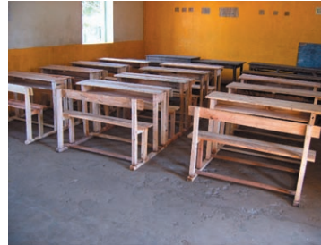
The 30 new benches were produced in Tamatave.

As mentioned in the last newsletter the pupils from the primary school in Hemmoor (Germany) had donated money for the bench construction. Eleven of these benches were therefore financed with their donation. This is only one nice example that shows how small steps can turn into big ones!