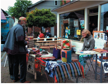
Members of MWC Deutschland at the Ferry Market